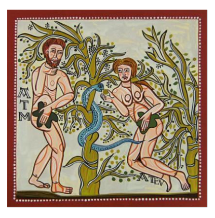
Close-up of the mural at the Hermitage of the Vera Cruz of Maderuelo (Segovia).