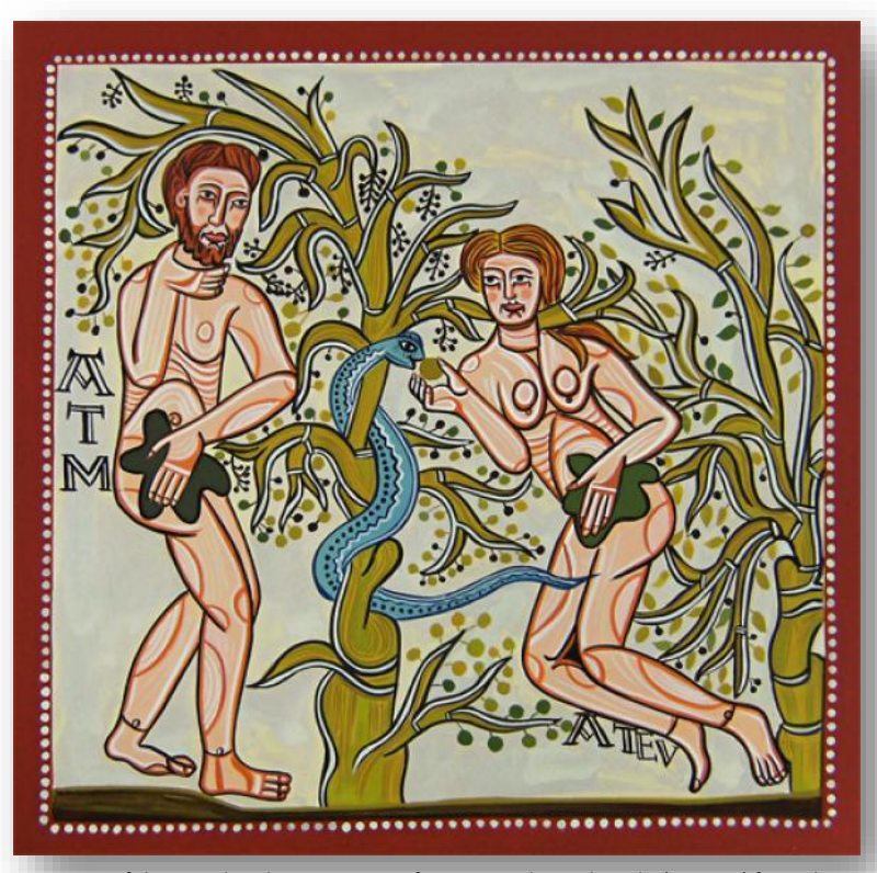
Fragment of the mural at the Hermitage of Vera Cruz de Maderuelo (Segovia) from the XII Century. Currently in the Museo del Prado (Madrid).