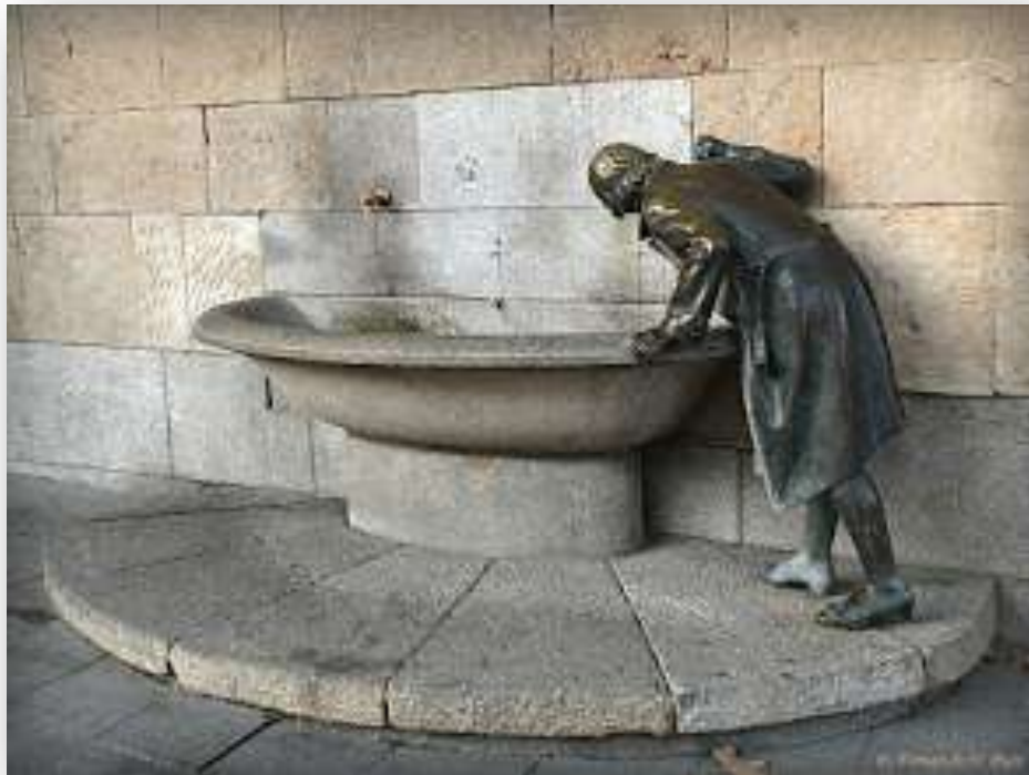
" Dama de la fuente ". Fountain of the Ayuntamiento de Logroño and bronze statue by Francisco López (1932).