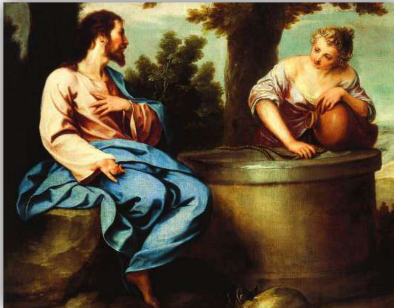
Detail of the painting, "Jesus and the Samaritan Woman," Alonso Cano Real Academia de Bellas Artes de San Fernando